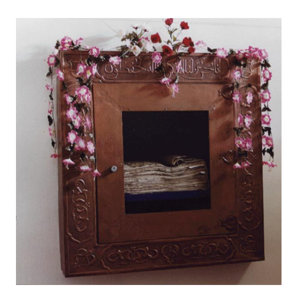
Figure 2 The Holy Quran of Othman in its glass-fronted safe.