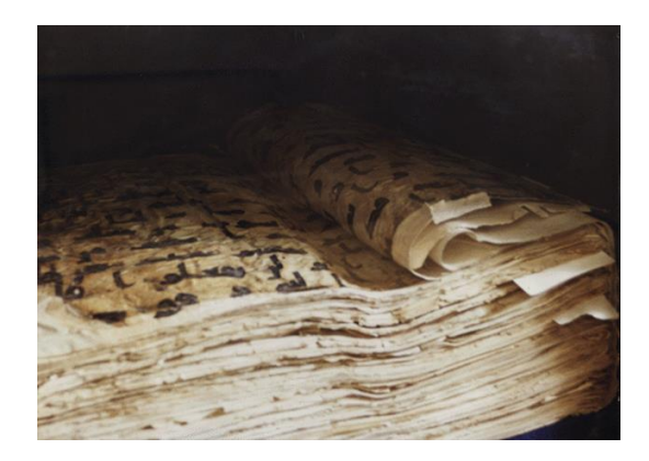
Figure 1 This manuscript, held by the Muslim Board of Uzbekistan, is the earliest existent written version of the Quran. It is the definitive version, known as the Mushaf of Othman, superseding all other versions.

"It may be the Imam manuscript (name used for the copy kept by Uthman himself) or one of the other copies made at the time of Uthman."[4]