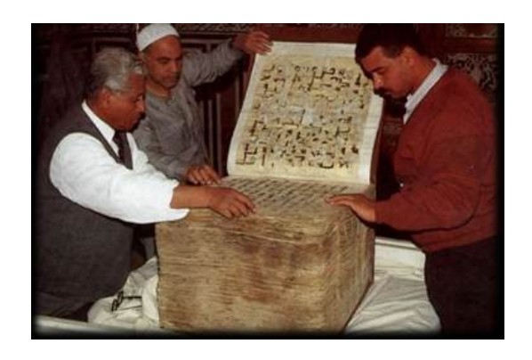
Figure 3 An Early Quranic Manuscript At The Al-Hussein Mosque, Cairo, Egypt.