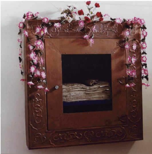
Figure 2 The Holy Quran of Othman in its glass-fronted safe.