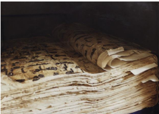
Figure 1 This manuscript, held by the Muslim Board of Uzbekistan, is the earliest existent written version of the Quran. It is the definitive version, known as the Mushaf of Othman, superseding all other versions.

"It may be the Imam manuscript (name used for the copy kept by Uthman himself) or one of the other copies made at the time of Uthman." [4]