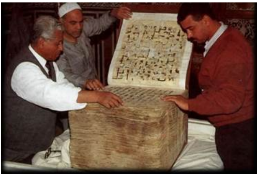
Figure 3 An Early Quranic Manuscript At The Al-Hussein Mosque, Cairo, Egypt.

(3) The third manuscript is kept in Al-Hussein Mosque, Cairo, Egypt and can be seen below.